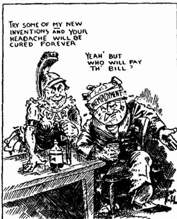
From Levantine Engineer's Journal